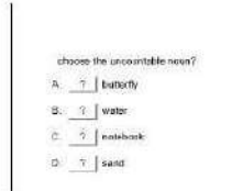
Fig. 1. The test form for writing short Quiz answers

The question is structured as follows: Multiple choice tasks give two or more correct answers.