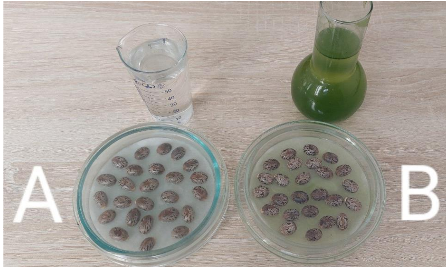
Figure 1. Germination of kanakunjut seeds in laboratory conditions in experimental versions of plain water (a) control and suspension of Chlorella vulgaris (B) on day 1.

The experiments were carried out in laboratory conditions. First, the seeds of the plant were sorted and placed in Petri dishes of 25 pieces. As a control option, the selected container was sprayed with plain water, and in the experimental version, a suspension of Chlorella vulgaris in an amount of 10 ml was sprayed on seeds and placed in a thermostat, providing a temperature of 240 °C [9].