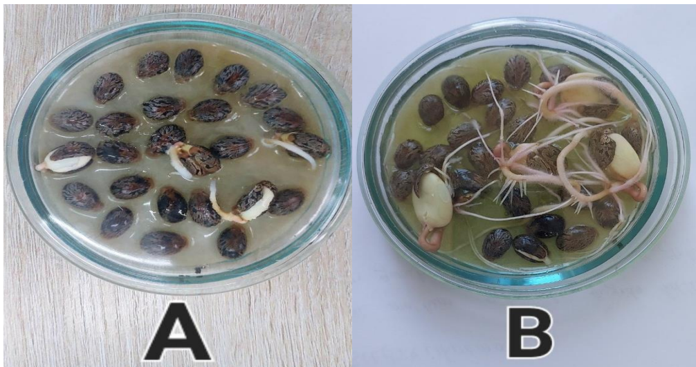
Figure 2. Germination of castor seeds in laboratory conditions in experimental versions of plain water (a) control and suspension of Chlorella vulgaris (B) on 8 th day.

The experiment was conducted both in the laboratory and in the field in order to study the intensity of growth and development of the castor plant ( Ricinus Communis L ).